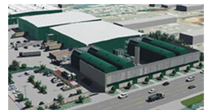
EDCO's Anaerobic Digestion Facility

Organic material discarded in your green organics bin will be sent to an organic waste diversion facility such as a composting or anaerobic digestion facility. In these natural processes, microorganisms break down organic materials such as food waste. Organic material is recycled into renewable natural gas and soil amendments.