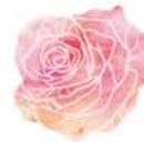
CLARE ROSE FOUNDATION